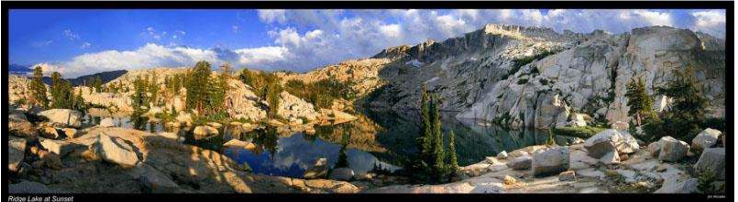
Ridge Lake at Sunset, Photograph by Stanislaus Wilderness Volunteer, Jim McCabe

Stanislaus Wilderness Volunteers (SWV) was formed in 1991 by a group of citizens who shared a love of wilderness and incorporated in 2003. SWV is a 501(c)(3) non-profit corporation, in partnership with the Stanislaus National Forest. SWV is dedicated to preserving the Wilderness areas of the Emigrant, Carson-Iceberg and Mokelumne, with the Stanislaus National Forest.