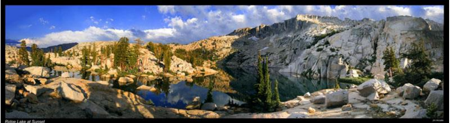
Ridge Lake at Sunset

Stanislaus Wilderness Volunteers (SWV) was formed in 1991 by a group of citizens who shared a love of wilderness and incorporated in 2003. SWV is a 501(c) (3) non-profit corporation, in partnership with the Stanislaus National Forest. SWV is dedicated to preserving the Wilderness areas of the Emigrant, Carson-Iceberg and Mokelumne, within the Stanislaus National Forest.